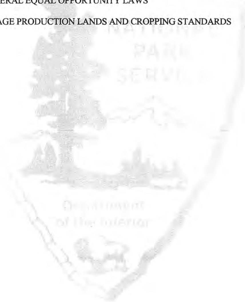
EXHIBIT E: SILAGE PRODUCTION LANDS AND CROPPING STANDARDS

EXHIBIT D: FEDERAL EQUAL OPPORTUNITY LAWS